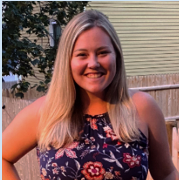
Teacher, Spanish & Dean of Students

B.A. Spanish concentration in Secondary Education from Keene State College